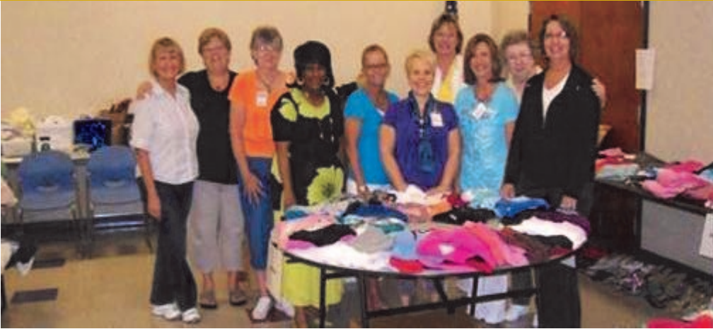
Jacksonville Chapter. Chapter Members pose with the donations to PACE.

Meeting was a Meet 'N' Greet event with a great speaker aimed at increasing membership. The ladies continued their annual nut and RADA knife sales this year as a fundraiser. The Chapter is pleased to report that they are on Facebook, please make sure to stop by and "Like" their page. The ladies also donated their time at the Clothes Closet for PACE.