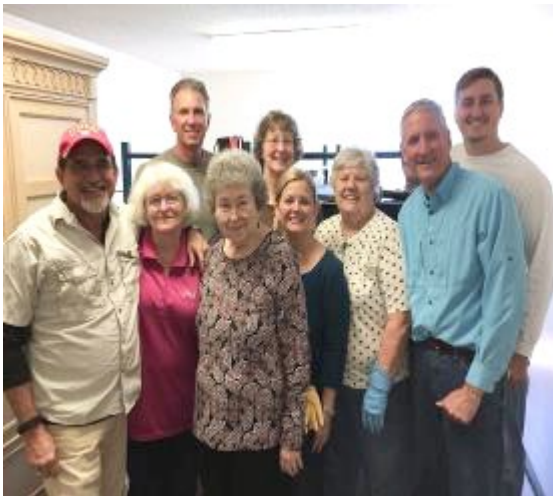
Volunteering at Trinity Rescue Mission to update rooms in the women & children's center

February's meeting included discussion on ideas for social activities for our chapter. In addition to our annual meet and greet recruiting event, we will plan some other fun activities which may include an Escape Room, a Murder Mystery dinner, Painting with a Twist, etc.