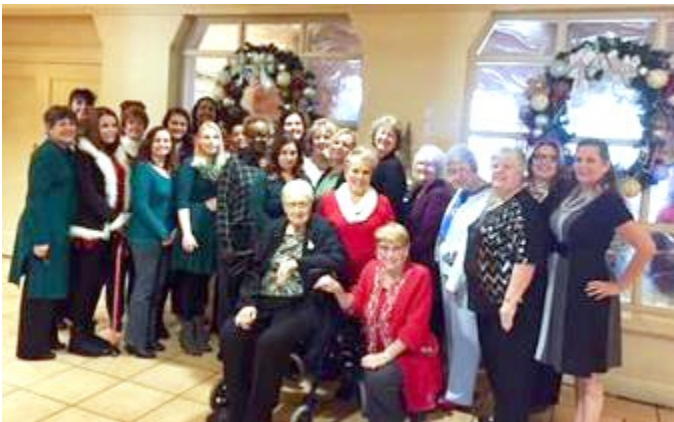
Participants attending the annual Holiday Brunch last December.