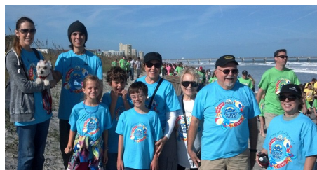
Members of Kristoph's Kool Kats who joined in the walk on Jacksonville Beach.