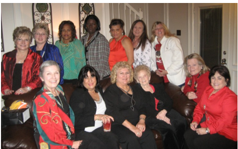
Members attending the Chapter's 2013 Christmas Party (husbands not shown)