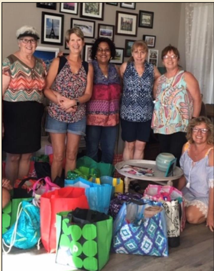
So. Florida Chapter gives Mother's Day totes to homeless shelter ladies