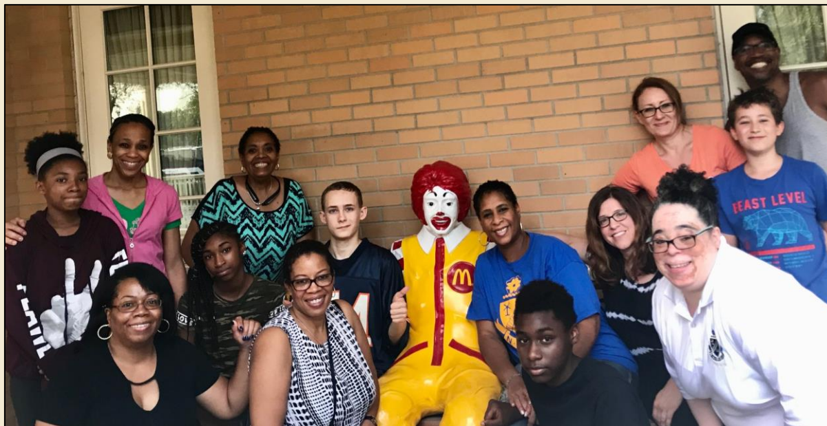
Ronald McDonald House Volunteer Activity