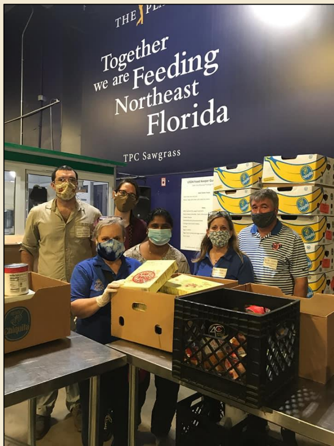
Jacksonville, Fl., Chapter Volunteers at the Food Bank