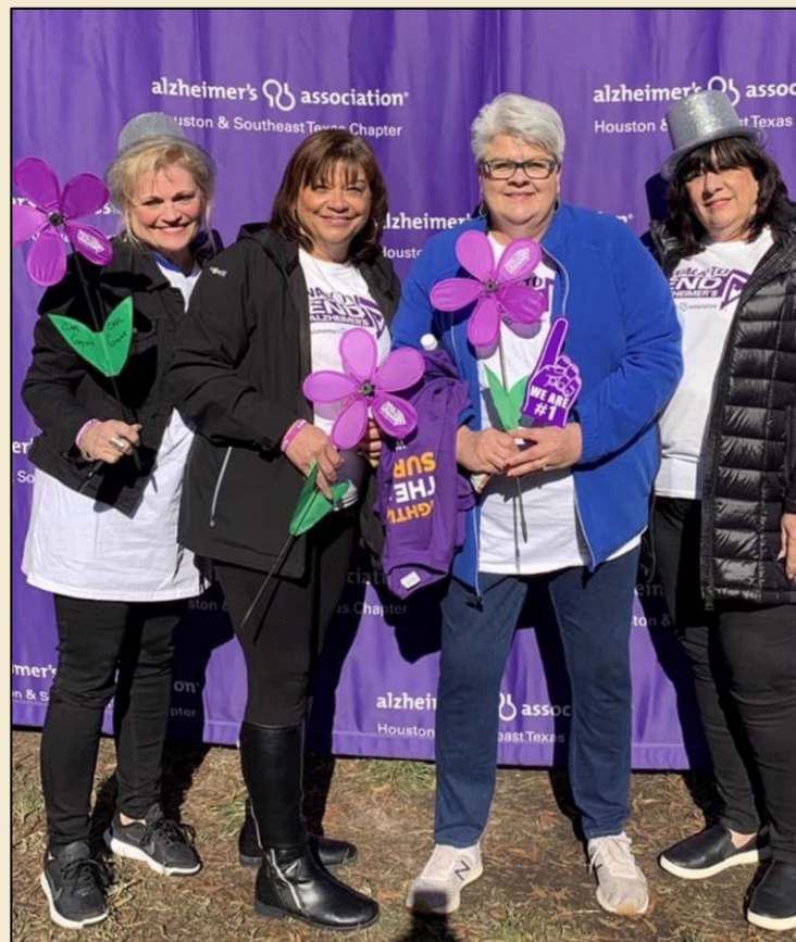
Houston Chapter Walk to End Alzheimer's