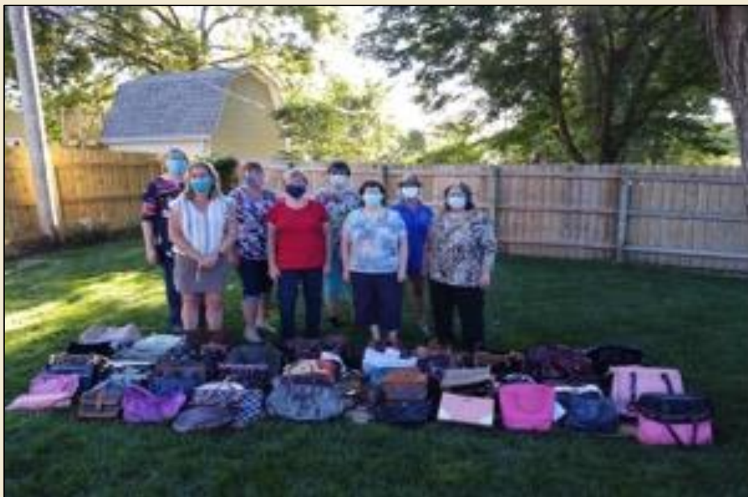
Omaha Chapter Purse Drive for the Catholic Charities Shelter for Abused Women