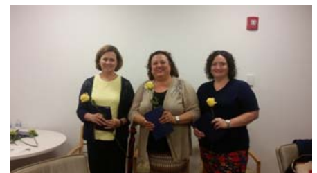
Pictured: September Membership meeting hosted by Metra

Schools and a book drive to benefit the Lurie Children's Hospital. The chapter continues to work on establishing its brand and has voted to order both t-shirts and polos with the NARBW logo. This will help identify the organization when the group is out doing charitable work or recruiting new members. Finally, as Narbies love sharing time and conversation, they hosted their 2016 holiday party on Saturday, November 12 th at the Flossmoor Station Restaurant & Brewery, in Flossmoor, Illinois.