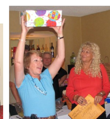
Fall Conference 2009