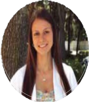
Recipient of the Clara Mayhall Scholarship