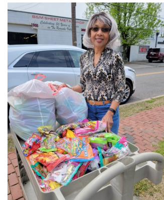
Salvation Army delivery

Our May project was Angels of Assisi Wish List. Our chapter 19 members donated pet supplies, pet food, office supplies and a check for $110 which were delivered to Angels of Assisi on May 10, 2023. Thank you fellow Narbies for your generous contribution to provide a safe and loving environment for the animals that are sometimes forgotten. You have great BIG hearts.