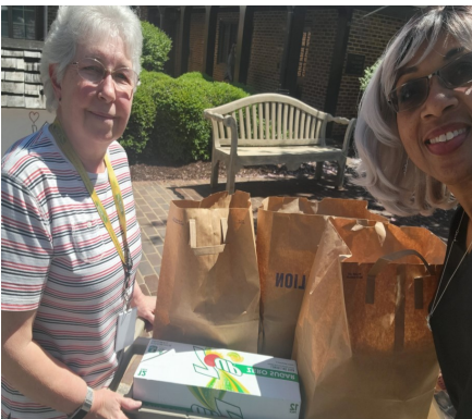
Ronald McDonald delivery

LOA Let's Give/Do Lunch Volunteer and/or donation opportunities and The Keystone Community Center will be our June projects.