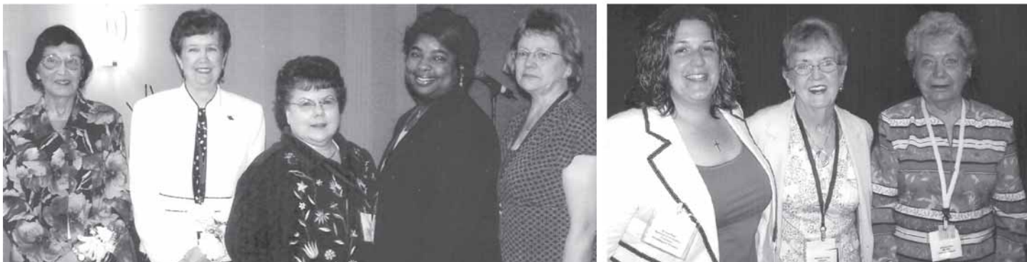
The photos above show the Women of the Year who attended convention in Philadelphia in May.

This year there were fifteen women chosen as their Chapter Woman of the Year. All of them are dedicated members who work to help NARBW thrive and to make their communities a better place. Together they are the face of the National Association of Railway Business Women.